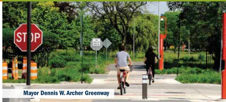
Mayor Dennis W. Archer Greenway

The Mayor Dennis W. Archer Greenway provides east side residents with safe and convenient access to the Detroit Riverfront along a beautifully-landscaped paved pathway.