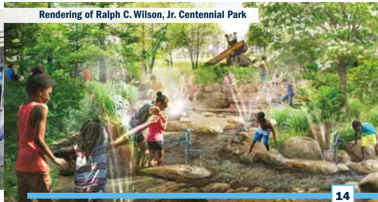
Rendering of Ralph C. Wilson, Jr. Centennial Park

West Riverfront Park closed to the public in summer 2022 as the park prepares for its transformation into Ralph C. Wilson, Jr. Centennial Park , which will open in 2025.